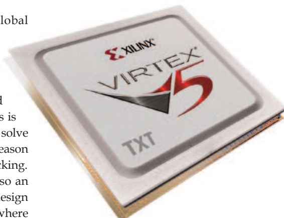
Virtex C2 AE-5 TXT FPGA from Xilinx

Now, even for a single family of product, the user has quite a few options to select from, such as ARM-based SoCs that are user-customisable. This helps reduce system power and board size while increasing system perfor-