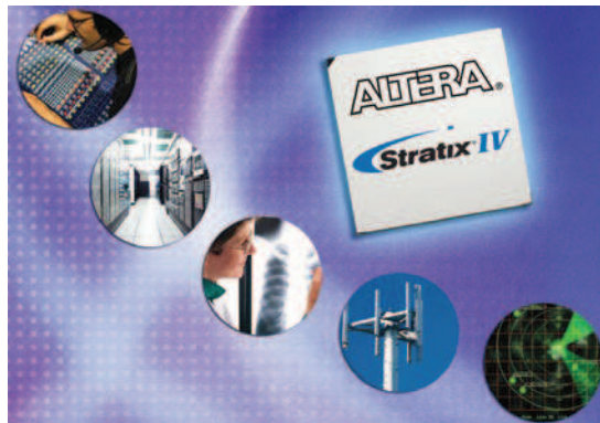
Altera Stratix HC IV FPGA

The video applications require frame or line buffering at multiple points in the path. With HD video, the video resolution and the frame rates have increased. With high-performance devices, DDR memory interfaces, readily-available DDR controller IPs and high-speed I/Os, the FPGAs are meeting the required high bandwidth for video applications.