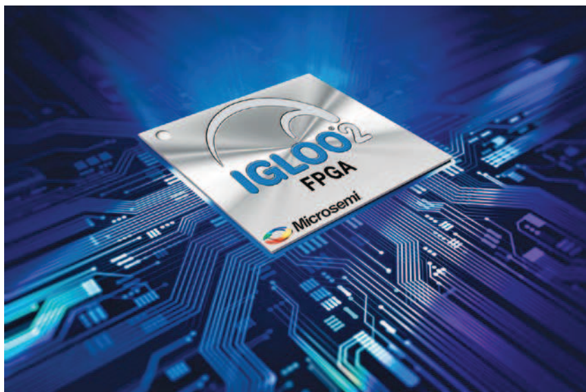
Microsemi IGLOO2 FPGA

FPGAs are growing fast in technology and density. The latest advances have generally helped the design engineer to handle complex designs in FPGAs with better accuracy in lesser time. Let us see how it is done